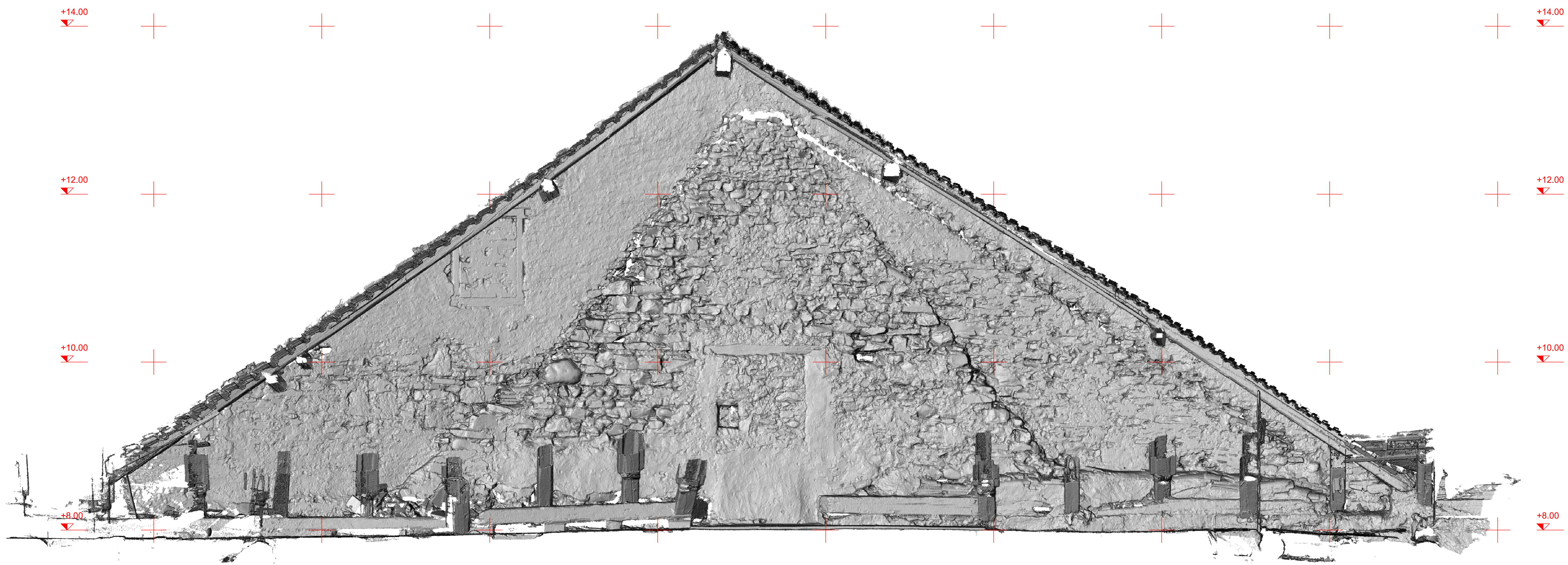
SPOT - M 1:20