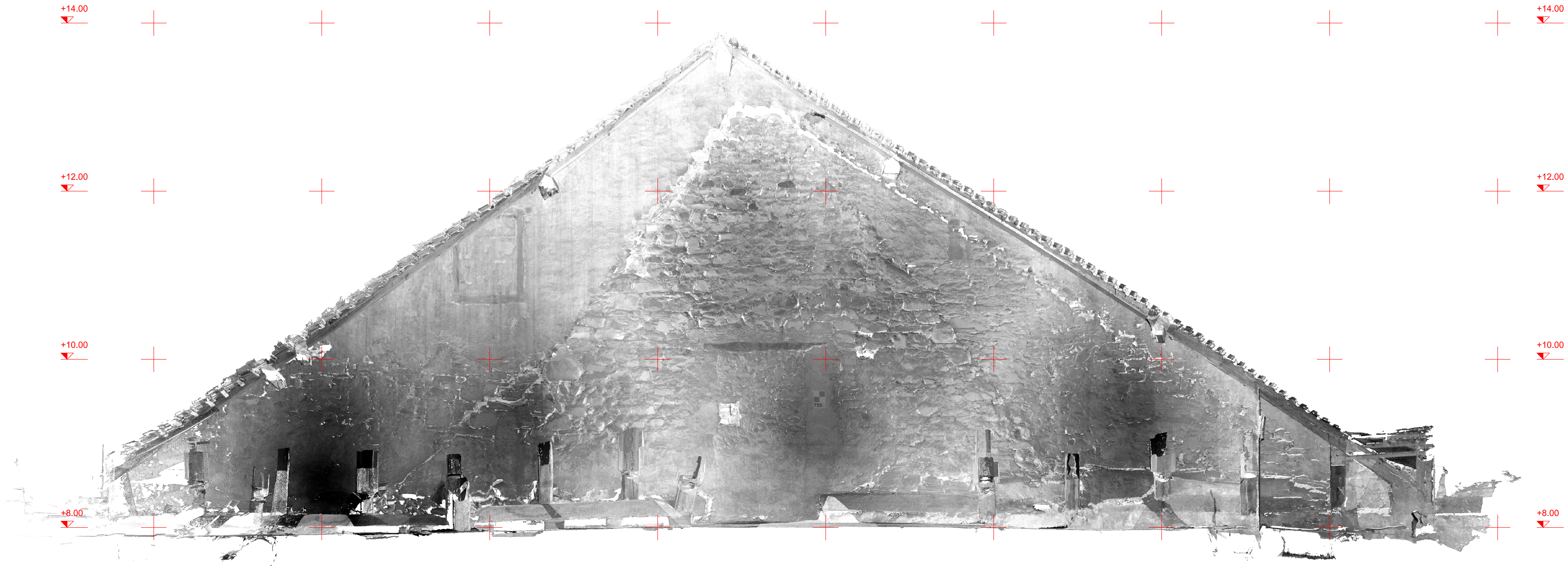
INTENSITÄTEN - M 1:20